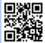
CSAEW April 2023 Leg Report

Check out the QR codes for information about our IBEW Legislative Priorities at the national & state level. And get involved in building our collecting political power here at IBEW #440.