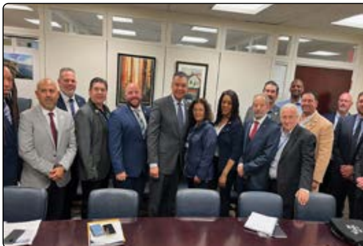
IBEW DELEGATION FROM CALIFORNIA MEETING WITH SENATOR ALEX PADILLA