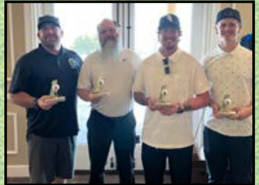
Most Honest Foursome