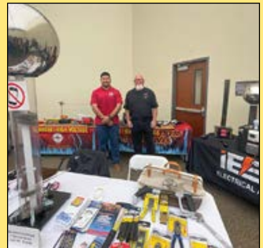
RUSD Junior / Senior Career Day Cal Baptist