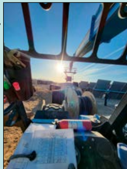
Oberon 1-2 Baker Electric at Desert Center