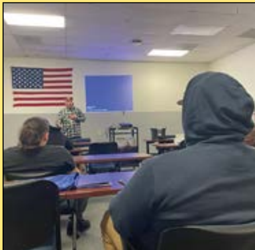
San Bernardino County Probation Offices