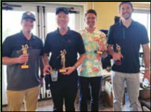
1st Place Best Liars