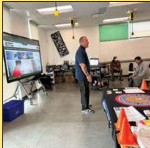
Desert Hot Springs High School Outreach